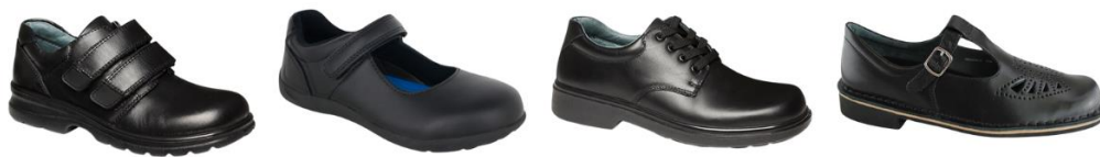
Examples of appropriate black school shoes

School shoes must be appropriate for the busyness of classroom and school yard play. A closed toe sandal is preferable for greater protection. Sports shoes must be predominantly white.