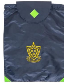
Whitefriars excursion bag