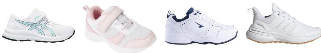
Examples of appropriate, predominantly white sports shoes