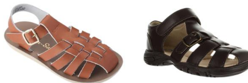
Examples of appropriate sandals (brown or black)