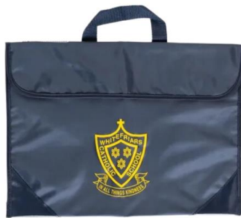
Whitefriars library bag